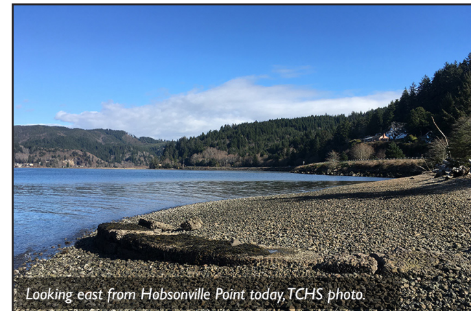
Looking east from Hobsonville Point today