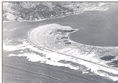
Kincheloe Point before construction of the Tillamook jetties.

If you have a story you’d like to share about one of Tillamook Bay’s historic points, please send me an email at chavee-cha@gmail.com .