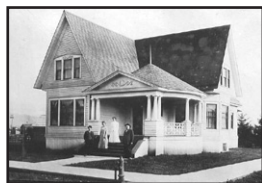
C.B. Hadley House

Originally, Tillamook was known as Hoquarton (from the Tillamook Native American language.) The Tillamooks fished in and near the slough. After white settlers came, the Hoquarton became the major waterway for commerce, boats docking along the slough, unloading foods, supplies and mail - even a car - and transporting cheese on the journey back. Until the Hwy 101 bridge was constructed in 1931, the only way to get to Rosenberg's was by boat.