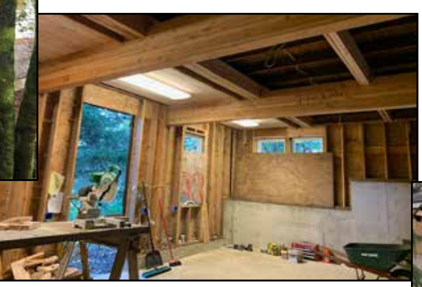
The basement ceiling, showing the structural improvements made to create the science lab, BCAC photo.

The second phase of the project involved enclosing the old back porch, reinforcing the floor structure, and creating an enlarged basement to house the science lab. Clair Thomas, science and natural resources advisor for the Tillamook