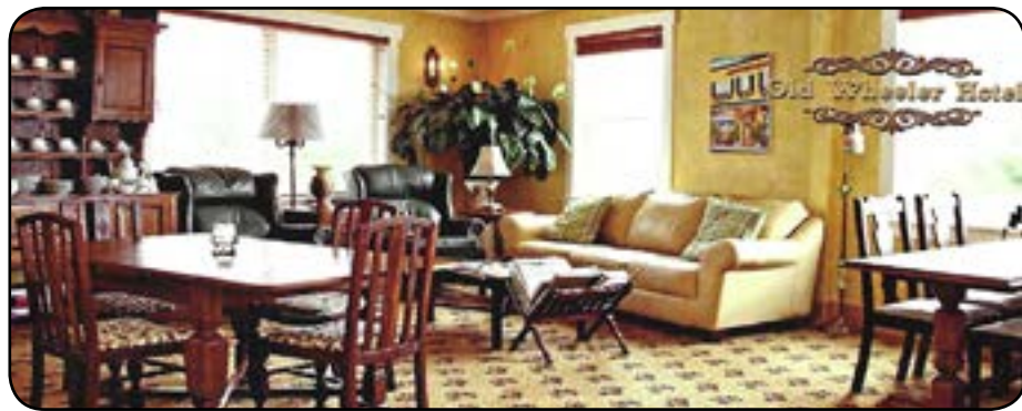
The "social activity" room which will be used for the TCHS meeting.