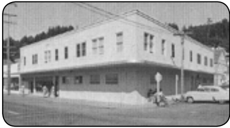
Rinehart Clinic 1950

the people of northwest Oregon forever. Patronage of the Hotel Wheeler declined until, in 1940, Dr. Harvey Rinehart purchased the building and began operating it as the Rinehart Clinic, which became well known as a facility for the treatment of arthritis. Patients would come from all over the States and stay in hotel rooms on the upper floor of the building while receiving treatments on the first floor and basement. The clinic eventually offered all forms of medical services until it closed its doors in 1981. The current Rinehart Clinic, now practices family medicine to this day in a modern facility just up the road here in Wheeler.